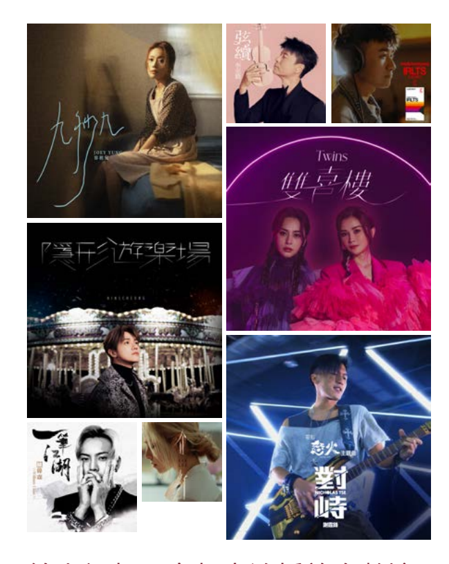
音樂、唱片製作及發行 Music, Album Production and Distribution

線上視頻及音頻串流播放次數逾 Online videos and music streaming over