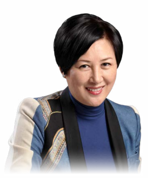
主席 Chairperson 英皇國際集團有限公司 Emperor International Holdings Ltd. 英皇娛樂酒店有限公司 Emperor Entertainment Hotel Ltd.