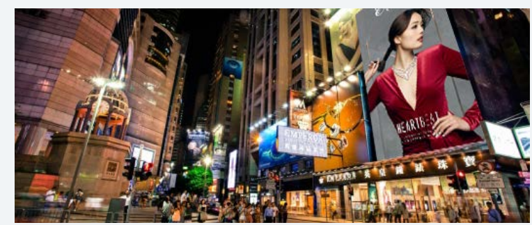
商舗 Retail Premises