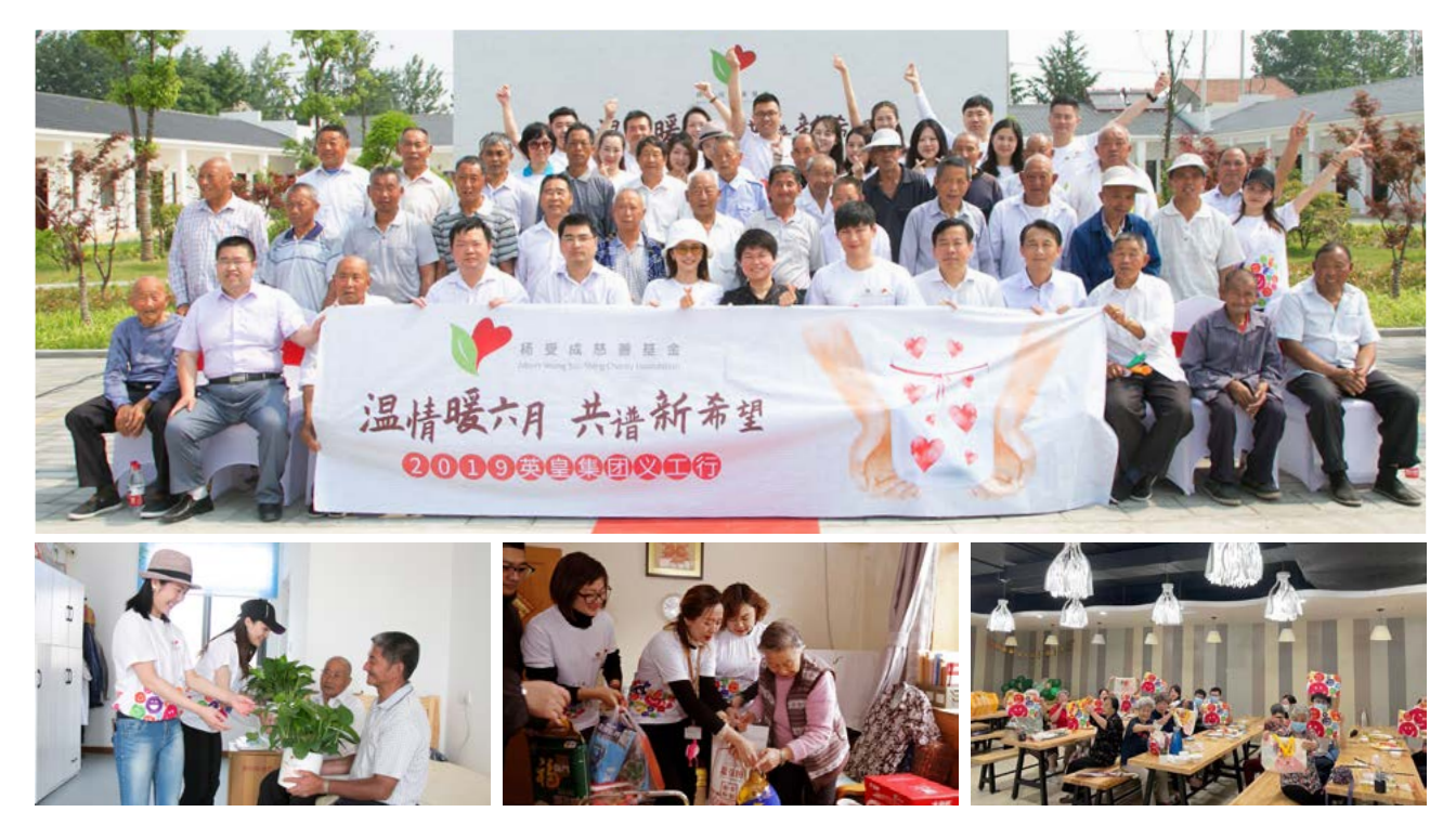
善念善行,從身邊事與人開始做起。慈善基金基於這個概念,推動「Empower Community」計劃,不受形式限制,只要 力所能及,實踐多一份善行,社會便多一份力量。

「Empower Community」計劃為集團旗下不同業務及人才提供一個價值共享的平台,結合業務資源及員工個人專長為有需要人士及社區賦能,例如社區入戶探訪、老年中心年度義工探訪、物資捐獻、家居修整、慈善觀影、慈善義賣、熱食援助、環保回收、捐血、資助教育等。集團積極鼓勵旗下位於香港、澳門及內地的員工、英皇娛樂藝人,甚至員工親友及青年團體定期組成義工隊到不同地區參與慈善事務,與社會弱勢社群共享發展成果。集團亦歡迎公眾一同響應,致力建設更美好社會。