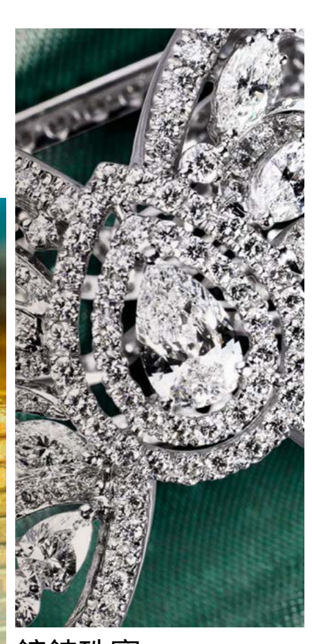
鐘錶珠寶 WATCH & JEWELLERY