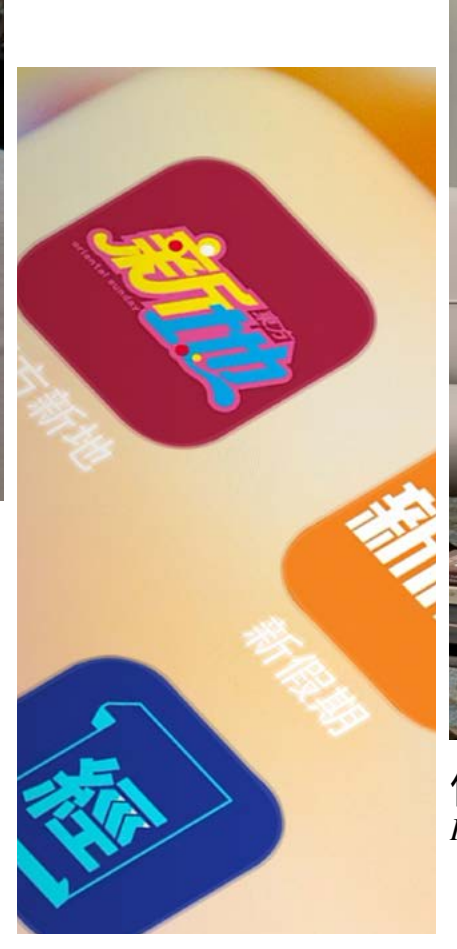
數碼媒體 DIGITAL MEDIA